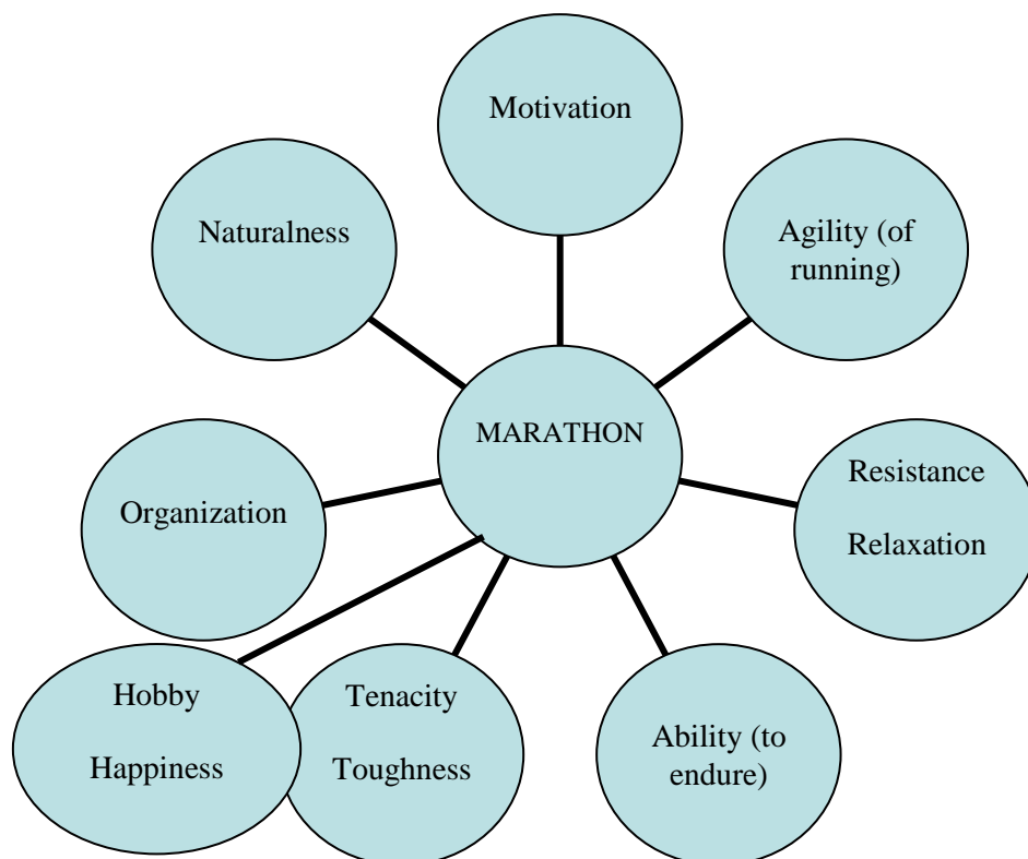
Figure 1. Acrostic for the term “Marathon”