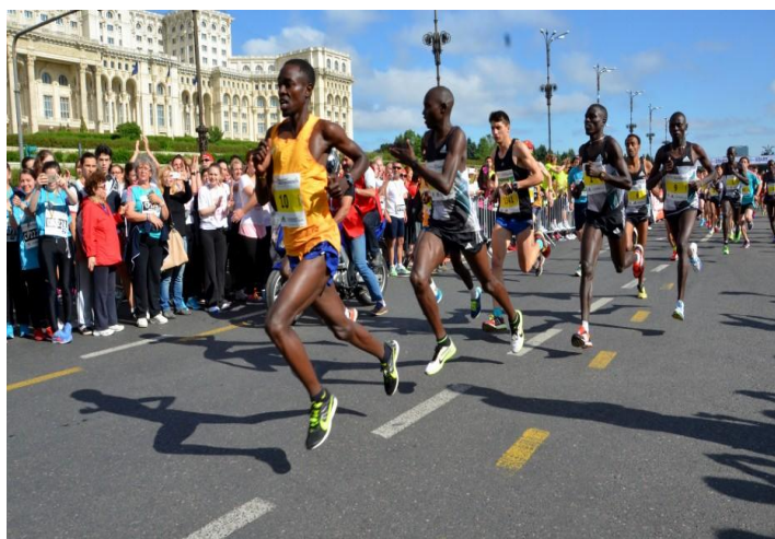
Figure 3. The Bucharest International Marathon

In the 21st century, organizing such events has a considerable impact on the population, from the motor, psychological, social and cultural perspectives.