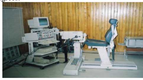
Fig (2) Biodex Isokinetic dynamometer Statistical analyses

The exercises are focused on PNF exercises and balance exercises and a full range of movement of 150 degrees.