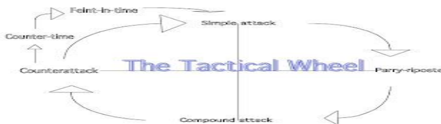
Fig 1 explain the tactical wheel

The tactical wheel is a sort of choose-your-own-adventure of fencing strategy. The simple wheel has two spokes- offense and defense (or offense and counter-offense). After choosing a path (for example, offense), the fencer will try to figure out what the opponent's reaction is. If it is, for example, to parry, the attacking fencer should use compound attacks (those that attempt to avoid the parry) instead of simple attacks (those that attempt to hit on the first action). If the defender is also following the tactical wheel, after being hit with a compound attack, he will wisely switch to a counterattack in time (aka "stop hit"). This can continue back and forth until someone either makes a technical error or switches spokes. Additionally, more advanced fencers often rely on the complex tactical wheel, which has some additional parts called counter-time and feint-in-time. (Federation International d'escream, 2002).