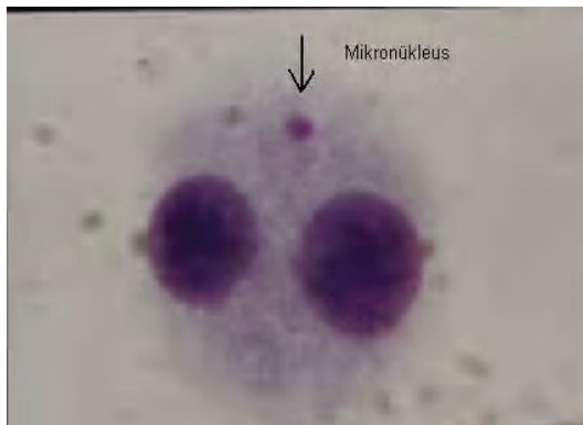
3.2. A micronucleus in a Cytokinesis Inhibited Binuclear Cell