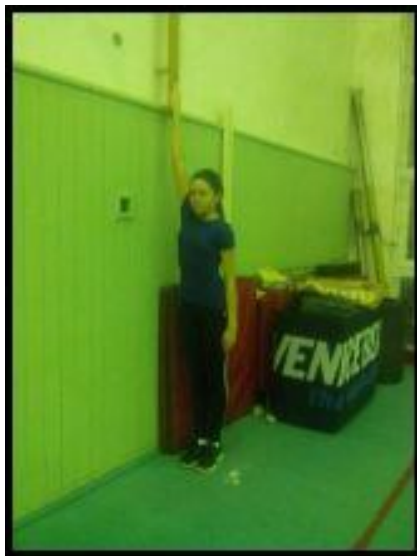
Figure 3. Model event