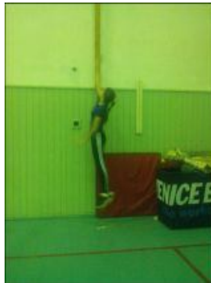
Figure 4. Model event